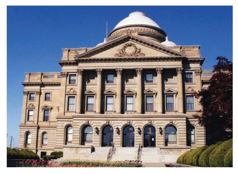
(USPS 322-840) PUBLISHED WEEKLY BY The Wilkes-Barre Law and Library Association

Advertising Must Be Received By 12 O'Clock Noon, Tuesday In The Week of Publication