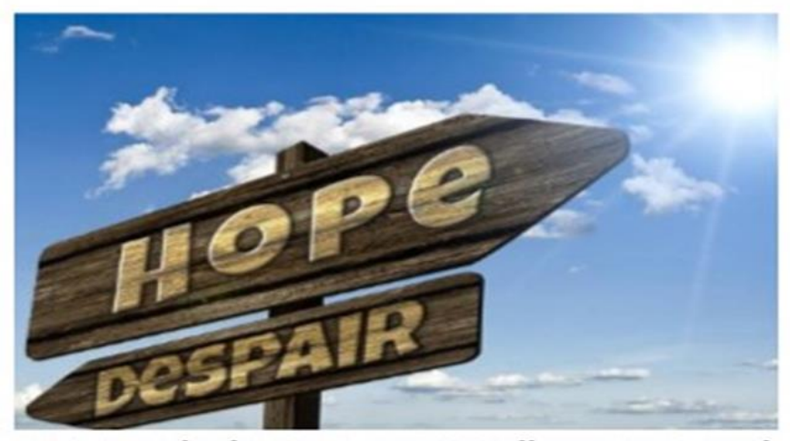
We can help you, your colleagues, and family members.