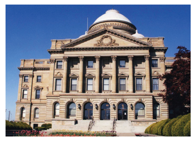
(USPS 322-840) PUBLISHED WEEKLY BY The Wilkes-Barre Law and Library Association

Advertising Must Be Received By 12 O'Clock Noon, Tuesday In The Week of Publication