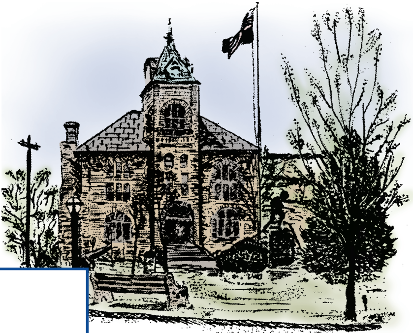
Drawing Courtesy of Joyce Love

POSTMASTER: Send change of address notices to MONROE LEGAL REPORTER, 913 Main Street, Stroudsburg, PA 18360