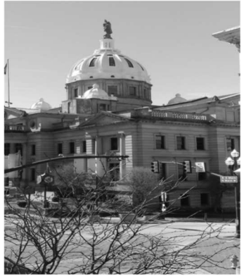
View of the Courthouse

$900/mo. including trash collection and sewage.